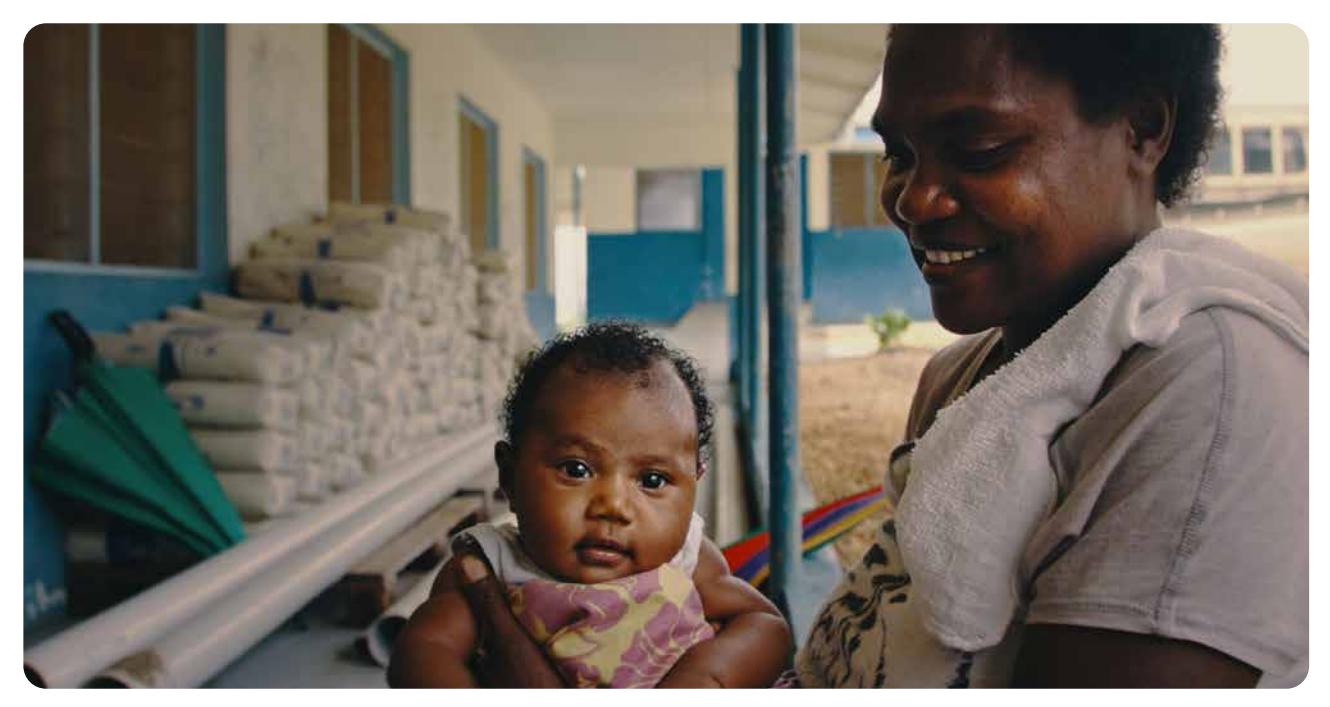
Melanesian woman with her child waiting at the local health centre in Vanuatu.

The leadership and decision-making capacities of individual WIN DRR members have been enhanced to lead and partake in decision-making to prevent, prepare, and recover from disasters. Collaborating with and supporting governing institutions to adopt more inclusive practices and policies has translated to more inclusive disaster risk management.