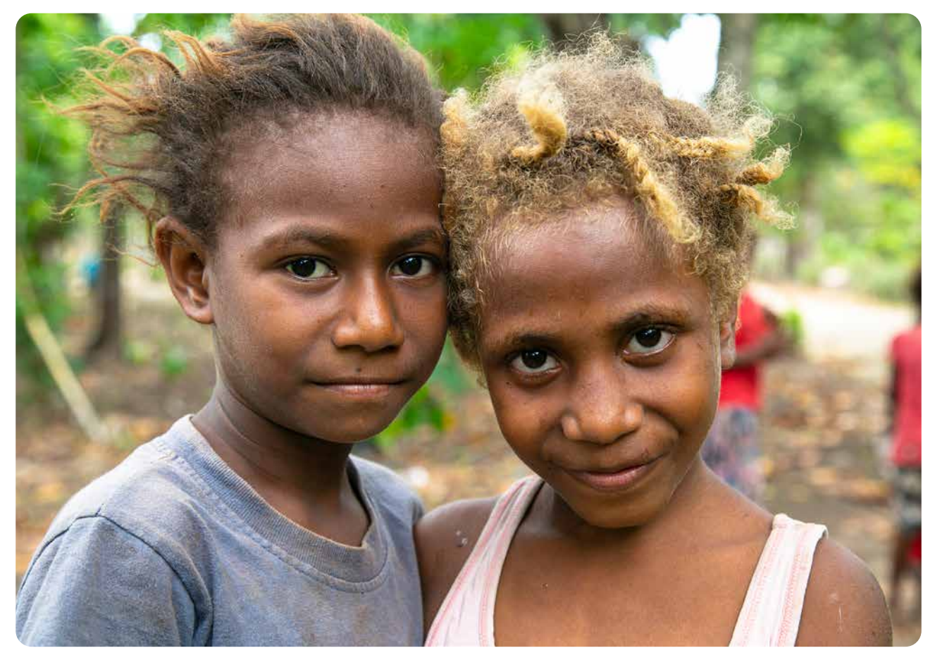
Local girls on Rah Island in Vanuatu.

Increased leadership and participation of diverse women (including young women, women with disabilities, and those who are marginalized) in disaster contexts is ensuring gender-equitable and accessible response and recovery resources. For example, the Shifting the Power Coalition programme has a greater focus on promoting diverse women's leadership at different levels to genuinely integrate women's voice at different levels. While the examples provided above are encouraging and demonstrate progress, perceptions of gender in the Pacific are primarily binary, with greater progress needed to extend inclusion to gender and sexual minorities (see more on emerging gaps later in this report).