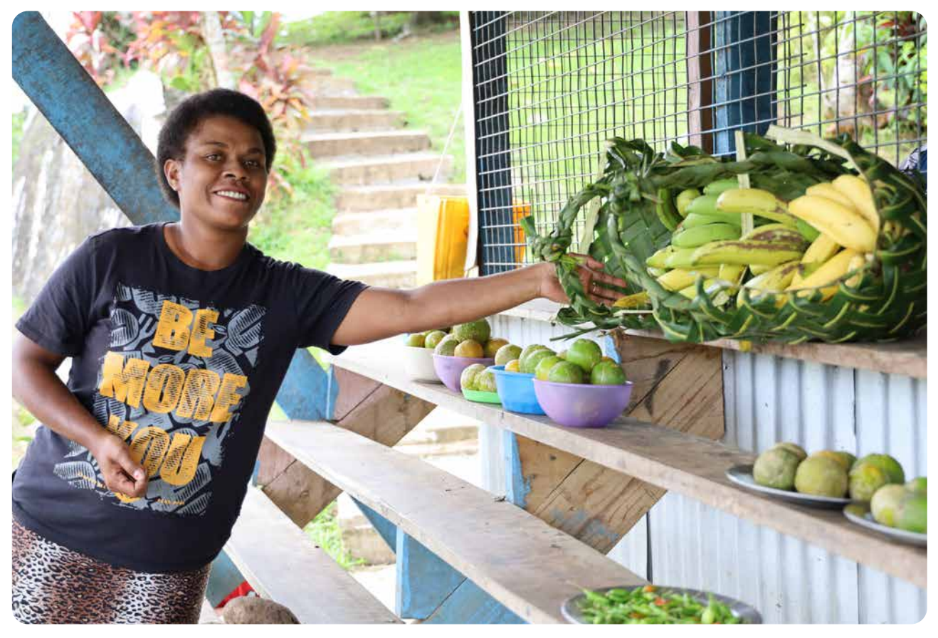
At the market near Suva, Fiji.

Women and girls at church in the Cook Islands.